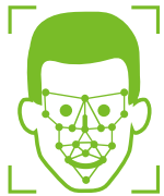
Access Control System

Our Pro series tripod turnstiles represent classic and safe way to protect your premises. They are used in various indoor environment applications. They fit perfectly as an economical option in the office buildings and other related applications.